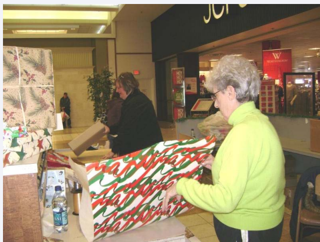
Christmas Gift Wrap Fundraiser Raises more than $8,000 for the United Way of Harrison County's 2011 Campaign

Located again in front of J.C. Penney's Department Store at the Meadowbrook Mall, United Way and member agencies, board members and dozens of community volunteers wrapped packages from the day after Thanksgiving until 6:00 p.m. December 24.